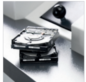
Practical stacking table for the material to be shredded.