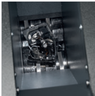
Specially hardened solid-steel cutting units manufactured from a single piece – robust, reliable and durable.