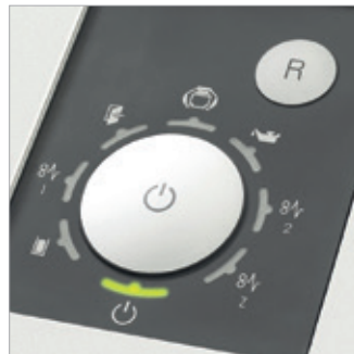
Extremely user-friendly: multi-functional operating and display element for continuous and return operation.