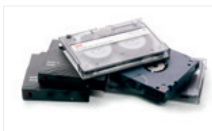
Shredding magnetic tapes