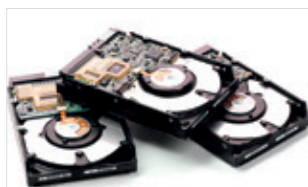
Shredding hard drives

Safe and efficient to use, data protection compliant.