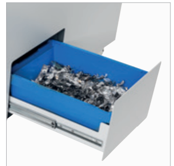
Removable waste container for effortless emptying.