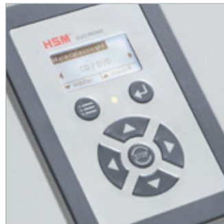
Intelligent control: multi-functional control and display panel to select the various functional modes.