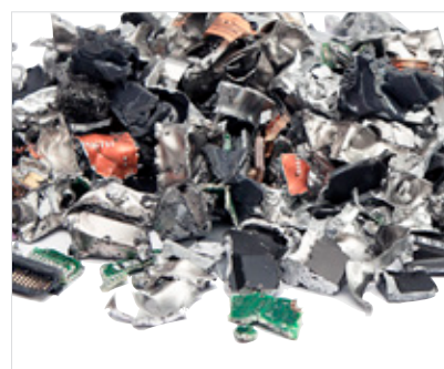
Hard drives in cutting size: 11,5x26 mm (<299 mm 2 ). Security level: H-5