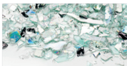
CDs, DVDs, Blu-ray discs in cutting size: 11,5 x 26 mm (299 mm 2 ). Security level: O-2