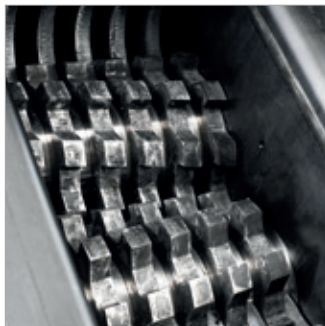
Specially hardened solid-steel cutting units manufactured from a single piece – robust, reliable and durable.