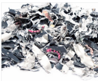
Hard drives in cutting size: 20 x 40-50 mm (<1000 mm 2 ). Security level: H-4