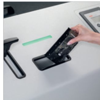
Intuitive operation: manual task via the feeding slot, a symbol on the display indicates when the next data medium can be inserted.