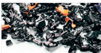
Magnetic tapes, credit cards and customer cards in cutting size: 11,5 x 26 mm (299 mm 2 ). Security level: T-3