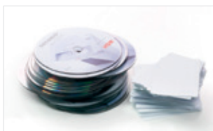
Shredding CDs, DVDs and Blu-ray discs, credit cards and customer cards