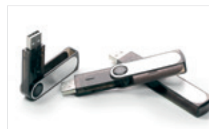
Shredding USB sticks (HDS 230)